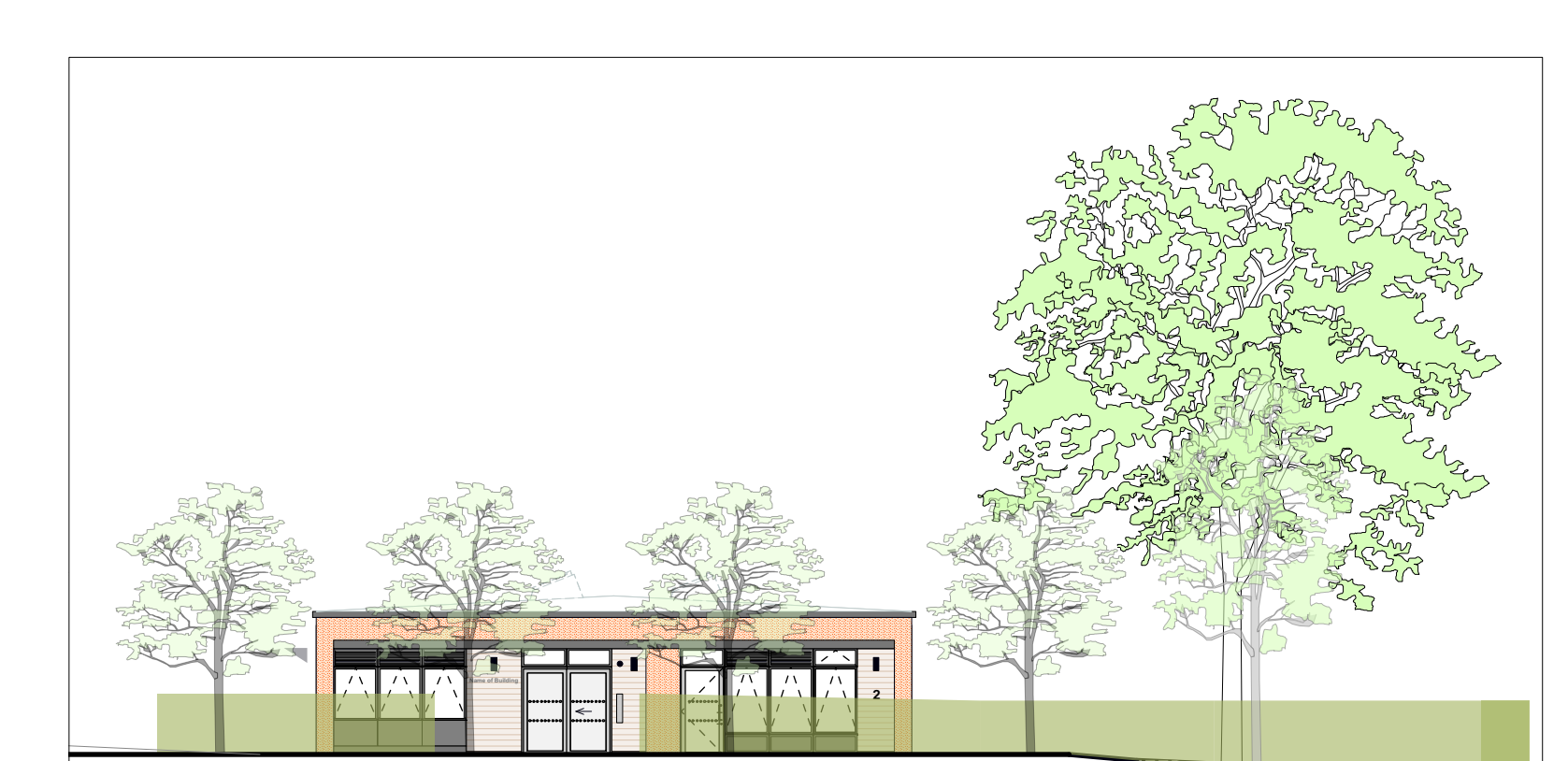
Proposed SEN Building West Elevation