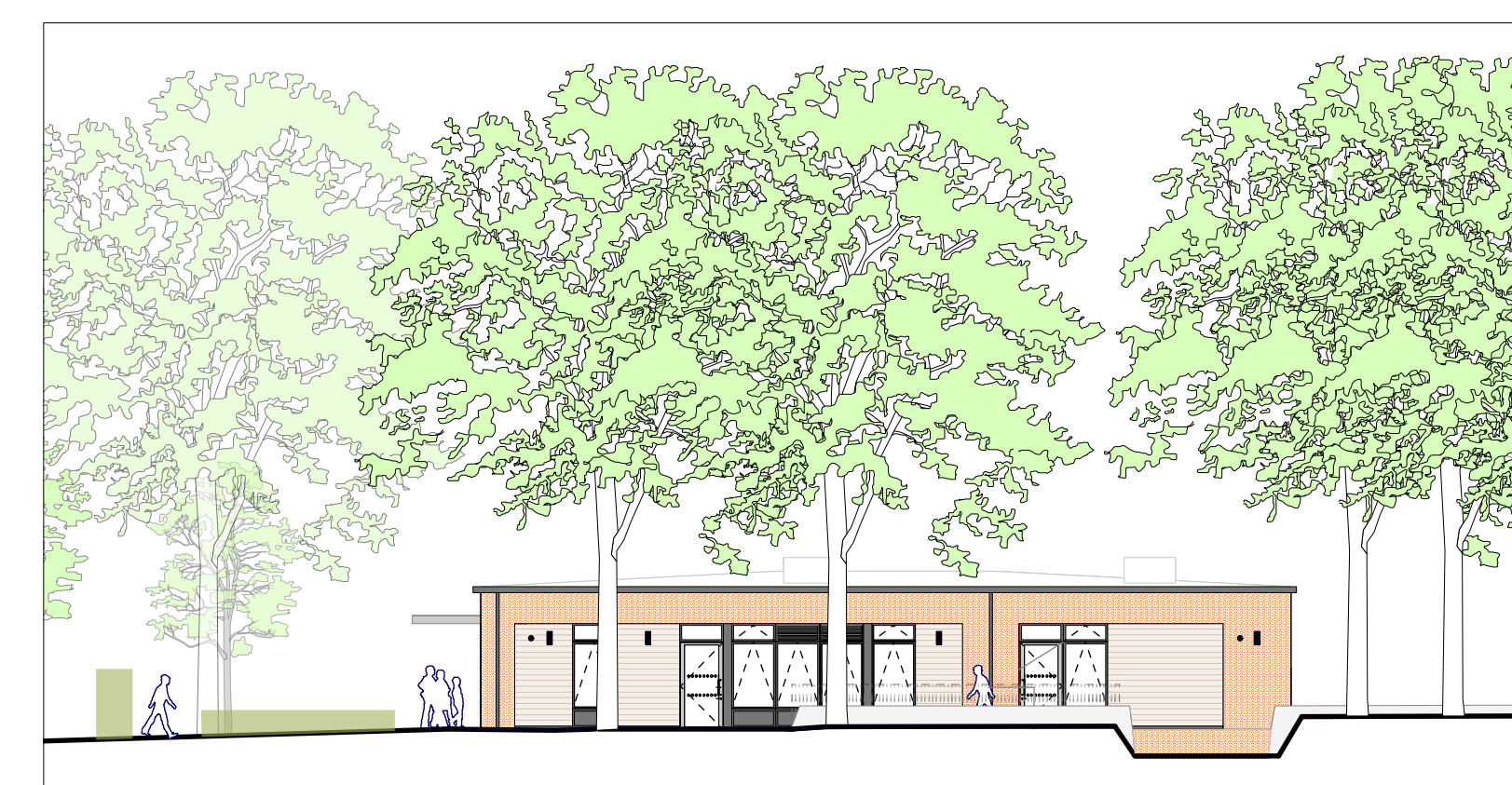
Proposed SEN Building South Elevation